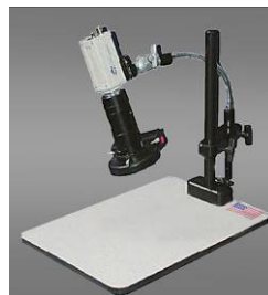
Table Scope 1x-450x magnification, carrying case, AC adaptor, cables and manual. Part # TS-450.....$1,295.00

High resolution inspection camera with zoom capability from 1x to 450x. Composite video out for connection to TV or projector. Can be used hand-held, on a table top, or mounted on an optional stand. Built in LED lights for perfect illumination with 2 illumination settings.